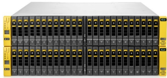
HPE 3PAR StoreServ 8000 Storage (4-Node Storage Base)