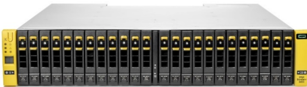
HPE 3PAR StoreServ 8000 Storage (2-Node Storage Base)

HPE 3PAR StoreServ 8000 is storage made effortless.