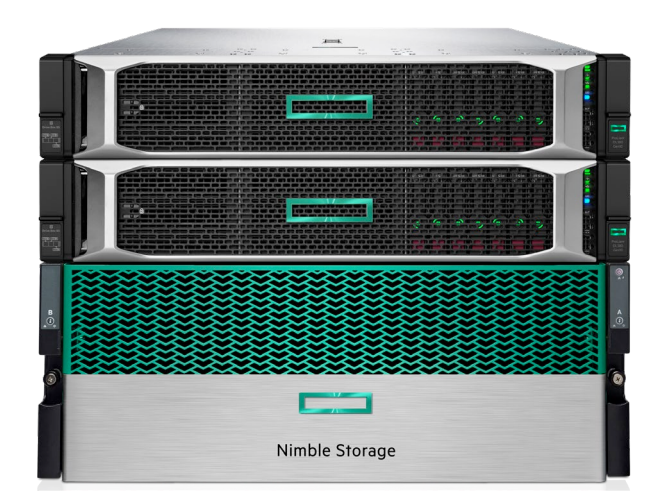
HPE Nimble Storage dHCI

With HPE Nimble Storage dHCl, enterprises can run faster with rack-to-apps in less than 15 minutes, end the fire-fighting with predictive analytics delivering 99.9999% data availability by HPE Nimble Storage, and optimize everything with higher productivity and maximum resource efficiency.