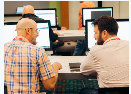
Managing Protection with Zerto